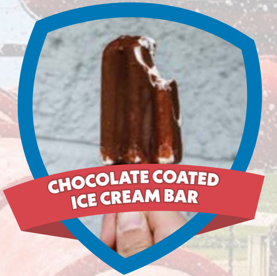
CHOCOLATE COATED ICE CREAM BAR