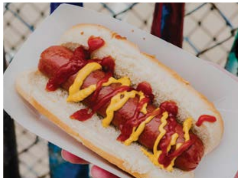
#67805 Ball Park Hot Dog