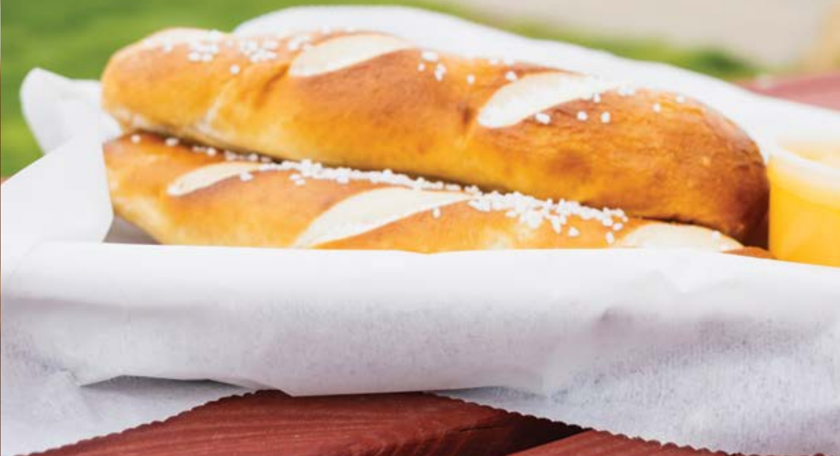
#75870 J&J Super Jumbo Pretzel

Beer and pretzels are the perfect snack pairing because the salt helps boost the flavor and hop bitterness of some beers, and provide a flavor contrast for less hoppy styles