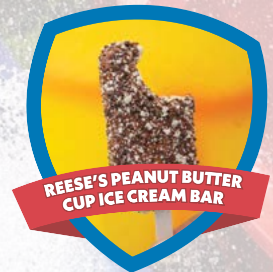
REESE'S PEANUT BUTTER CUP ICE CREAM BAR

Enjoy classic sweet treats like Prairie Farms Super Pops (#78190) which are blue raspberry, lemon and cherry flavored. Or, try out the Prairie Farms Strawberry Shortcake Bars (#78655) which are strawberry flavored ice cream surrounded by vanilla ice cream and coated with strawberry shortcake topping to give it some crunch! The Good Humor Reese's Peanut Butter Cup Ice Cream Bars (#78616) are filled with peanut butter ice cream and coated with chocolate ice cream and a crunchy peanut butter and chocolate topping. Schoep's Chocolate Coated Ice Cream Bar (#74385) is a tried and true classic made of vanilla ice cream and coated in hard chocolate.