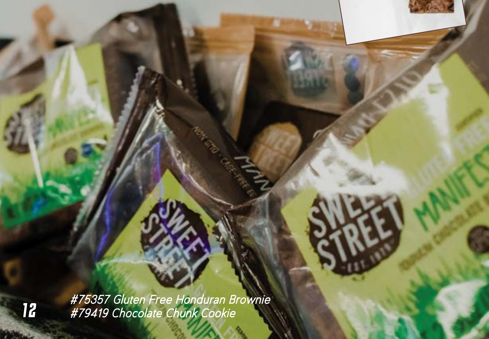
#75357 Gluten Free Honduran Brownie #79419 Chocolate Chunk Cookie