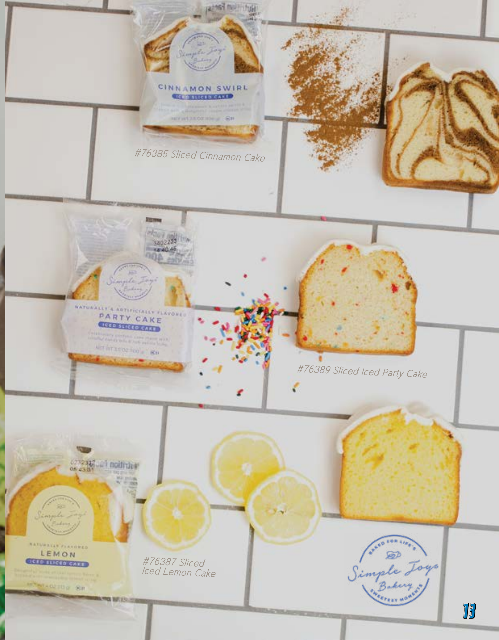
#76385 Sliced Cinnamon Cake