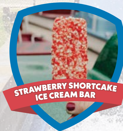
STRAWBERRY SHORTCAKE ICE CREAM BAR