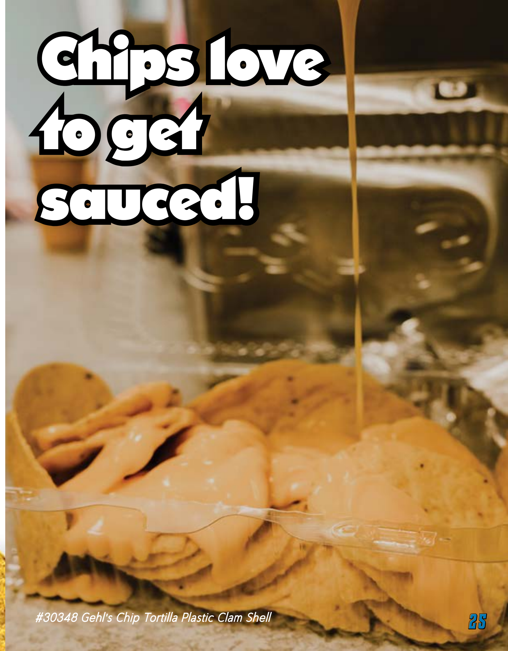
#30348 Gehl's Chip Tortilla Plastic Clam Shell