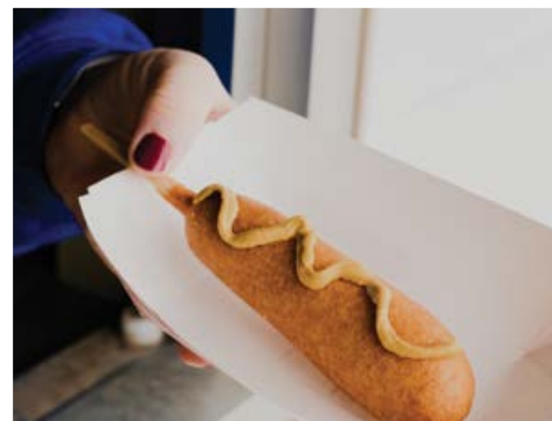
#66654 State Fair Corn Dog

Corn dogs have become a big part of American culture, especially at state fairs. Their popularity has grown so much, that you can now find them in the freezer sections of grocery stores and at restaurants too. This classic American cuisine is the perfect easy snack to stock and serve to customers.