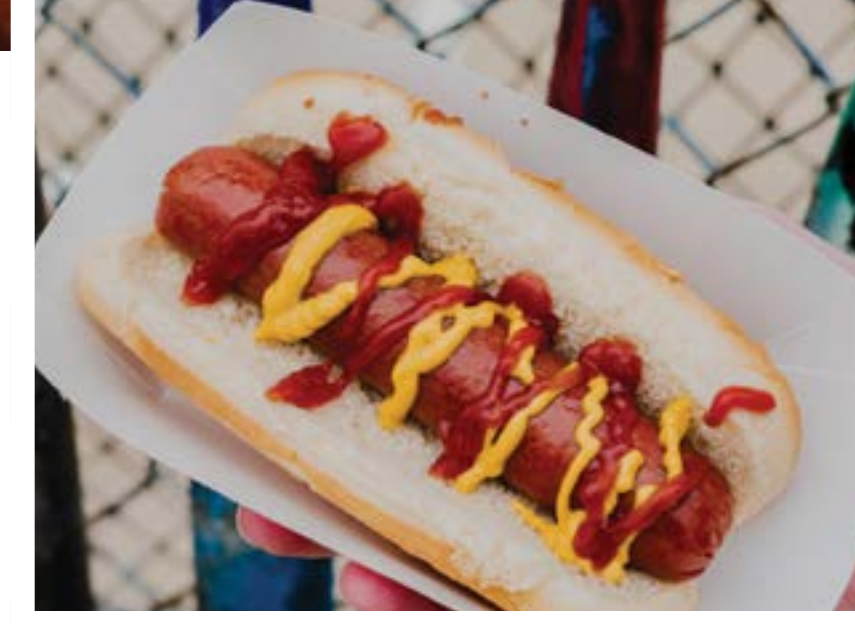
#67805 Ball Park Hot Dog