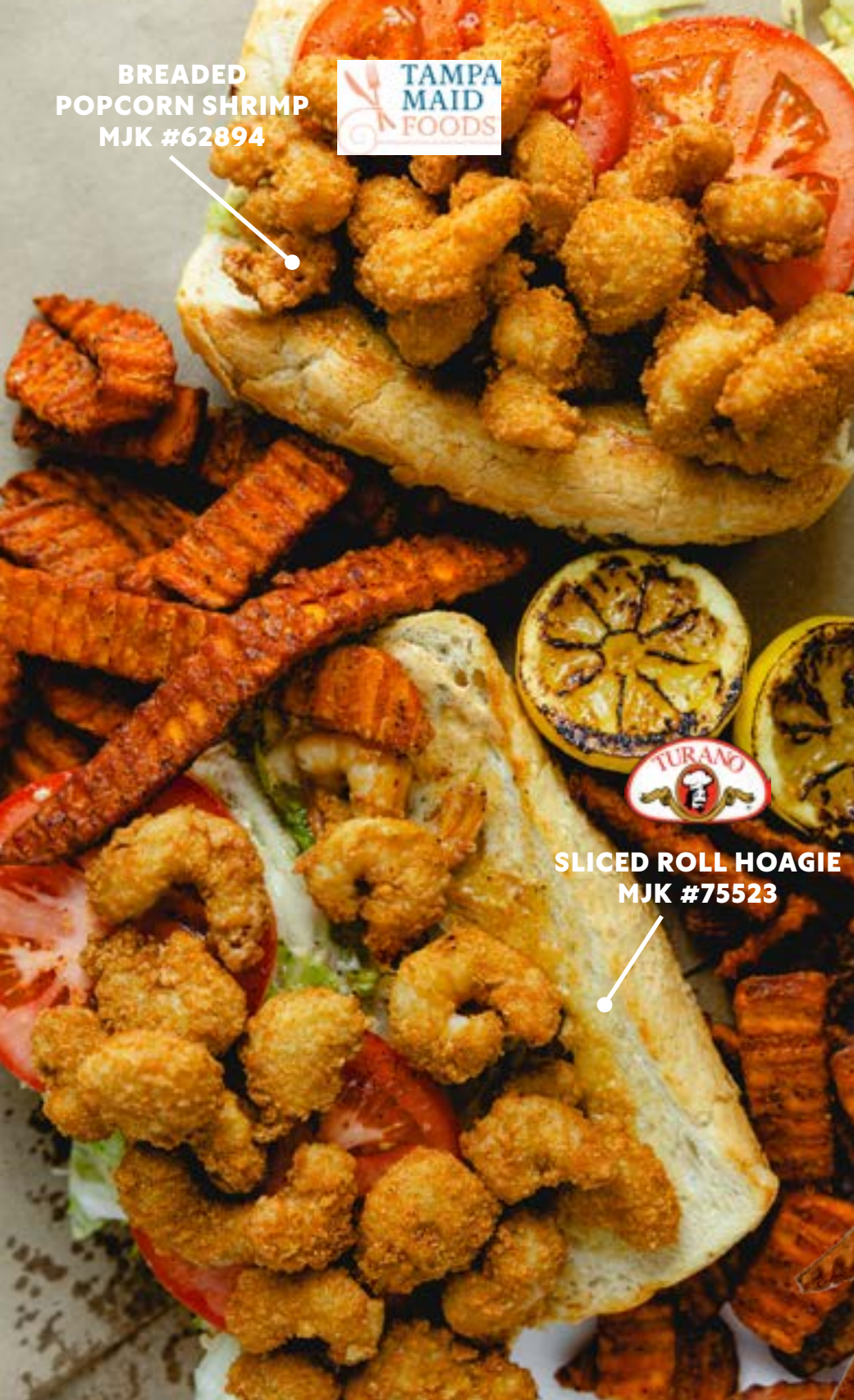
SLICED ROLL HOAGIE MJK #75523