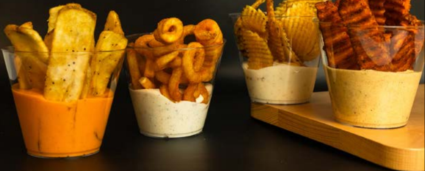
RIBCUT SWEET POTATO MJK #74503